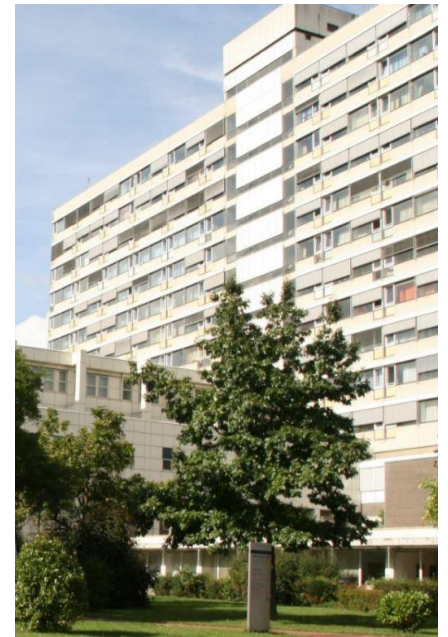
The existing hospital building in Frankfurt which was built in the 1960s.

Since the initial planning stages, Heilig had argued in favour of implementing the new building to a highly energy-efficient standard. "I am proud that we have been successful in achieving this milestone". In a hospital, the electricity consumption is generally three to four times higher than in a residential building. In the baseline study on the implementation of the Passive House concept in hospitals, it is clear that the equipment in a hospital has a major influence on the energy demand and must be considered to its full extent. Using conventional verification methods however, only the energy demand for heating and cooling, ventilation, potable water and lighting is considered. With these methods though, almost half of the actual energy demand is disregarded during the planning phase.