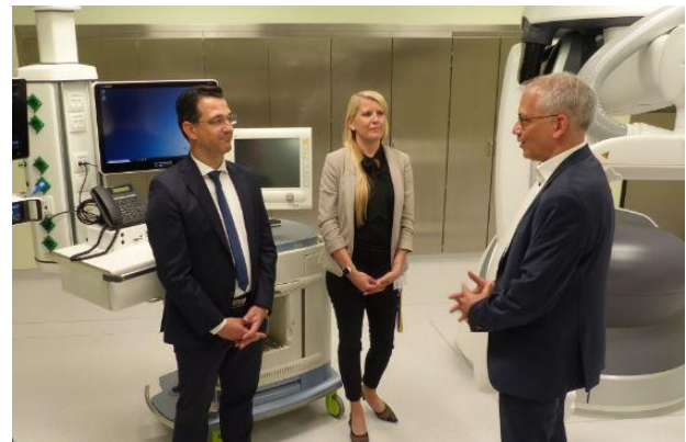
Minister for Economic Affairs of Hesse Al-Wazir (right) views the hybrid OR with integrated imaging techniques in the new hospital building.

The minister further explained that the best kind of energy is the one not consumed in the first place. The state government of Hesse is therefore committed to saving energy, energy efficiency and renewable energy. The federal state was pleased to have promoted and supported this exemplary model of a climate-friendly building with an energy standard that far exceeds statutory requirements. Due to their intensive 24-hour operation, hospitals belong to one of the biggest energy consumers in buildings: a large number of technical devices are used in the emergency room and operating theatres with intensive care units as well as in the patients' rooms. "This precisely is why the energy-efficient concept is particularly worthwhile for hospitals with their high energy demand. This applies for efficiency measures for the building itself as well as for energy-efficient technical devices," explained Dr Jürgen Schnieders, a managing director of the Passive House Institute. The research institute was closely involved in the planning and construction phases of the new building.