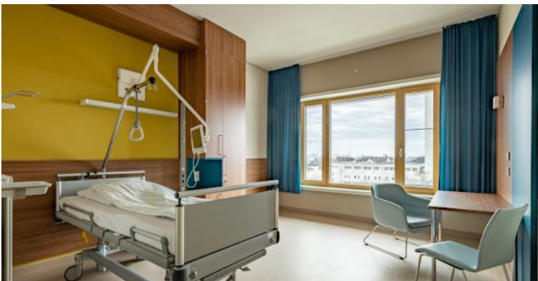
The patient rooms in the new building of the Klinikum Frankfurt Höchst are larger. This facilitates manoeuvring of beds and devices for all those involved.

Menger described other advantages of the new building: the patient rooms are now slightly bigger, which makes the manoeuvring of beds and devices easier for all involved. Moreover, all patient beds are equipped with touch screens which can be used for medical supervision as well as entertainment for the patients. During the presentation of the Passive House certificate, Rosemarie Heilig, head of the Climate and Environment Department of the city of Frankfurt, described the new building as a "beacon project for all hospitals which will be built in the future".