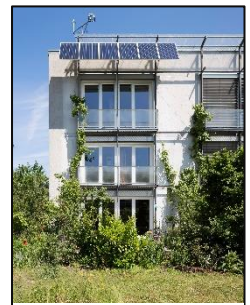
The world's first Passive House building in Darmstadt, Germany recently celebrated its 30th

Advantages of Passive House buildings: In a Passive House building, in winter the heat is retained for a very long time since it escapes very slowly. In the summer (and in hot climates), among other things, the excellent level of insulation ensures that the heat stays outside. Therefore, active cooling usually isn't necessary in residential buildings (in Central Europe). Due to the low energy costs in Passive House buildings, the utility costs are predictable - which is a fundamental principle for affordable homes and social housing. The Passive House standard meets the requirements of the European Union (EU) for Nearly Zero Energy Buildings (NZEB).