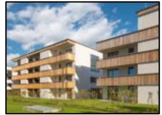
Socially compatible and highly energy efficient: apartment blocks built to the Passive House standard.

#Efficiency NOW: The call of the hour is to save fossil energy. To achieve this, the Passive House Institute has started the #EfficiencyNOW campaign. The research institute explains how each one of us can contribute towards becoming more independent of fossil energy, and ultimately phasing it out altogether. All information on this can be found on the platform Passipedia .