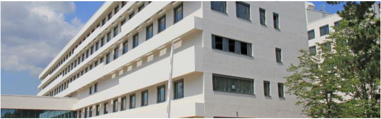
The new hospital building provides more than 660 beds for patients and another 40 beds in an outpatient clinic in addition to eleven operating theatres. Over 1600 employees will be working in the new building.